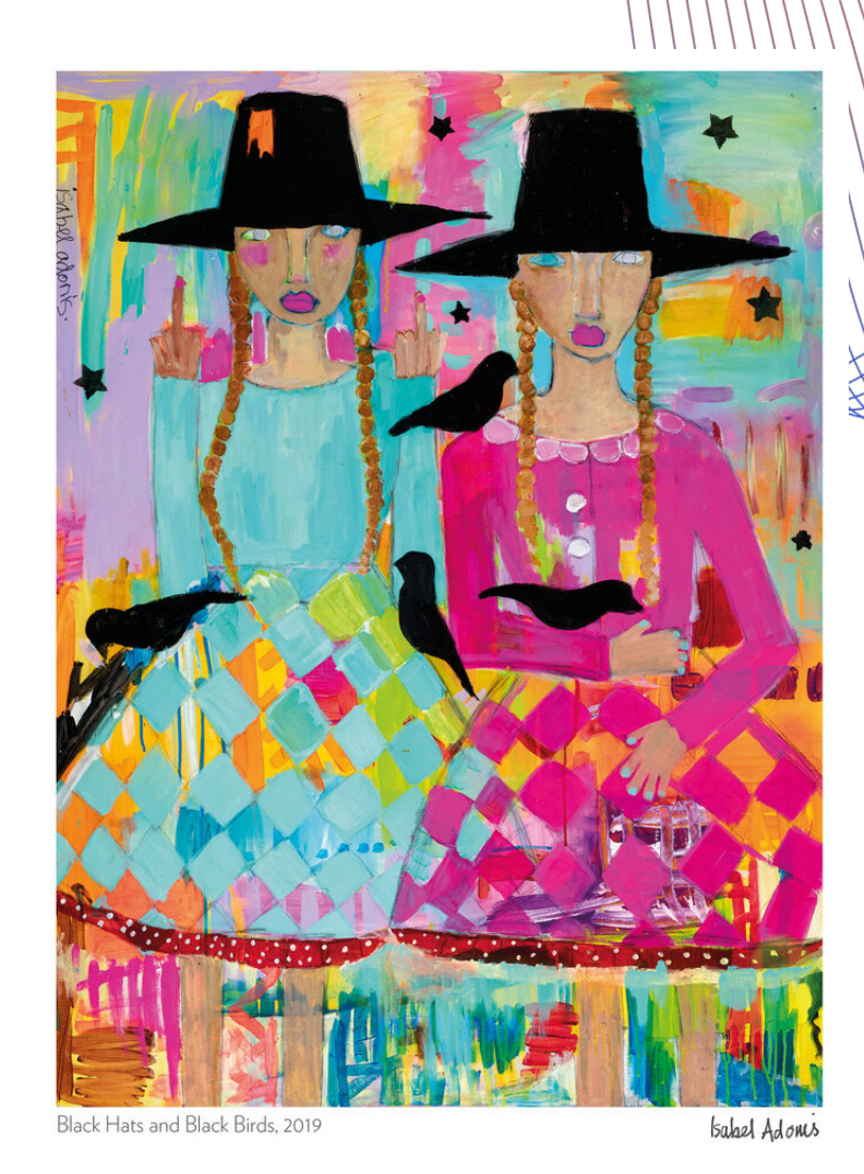
'Black Hats and Black Birds'

I'm Isabel Adonis and I'm of mixed heritage. I identify as half Welsh and half West Indian.